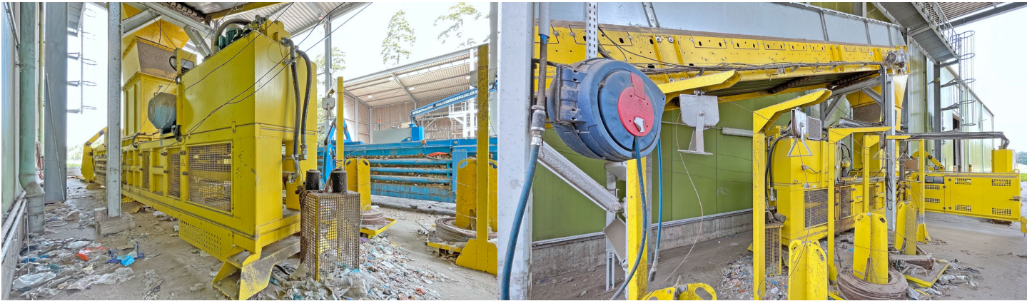
Baler Riko Ekos, type S-60K (6), 60 t pressing force, yoc 2019, only 2,320 operating hours, drive power 37 kW, with 4-fold horizontal tying system